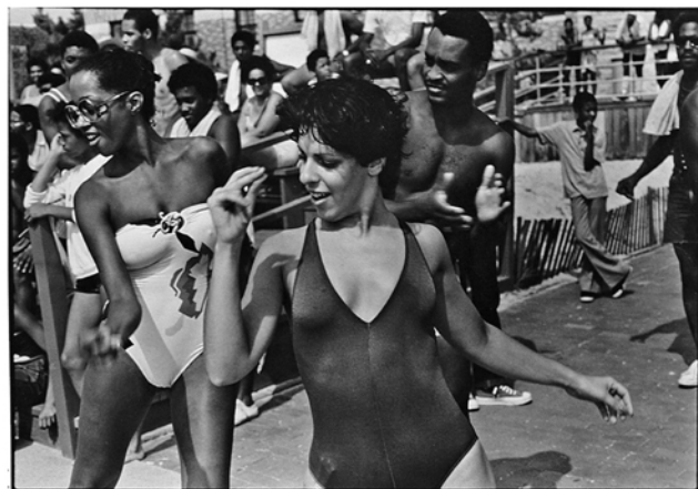
Jones Beach Disco, 1980