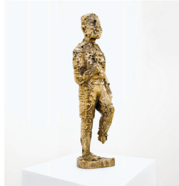
Sanford Biggers: BAM (for Michael), 2016, bronze, 19 x 5 x 5 inches.

Emilio is preparing a monograph for publication about the often overlooked ancient Greek city of Cyrene (currently Shahat, Libya) during the classical and Hellenistic periods, before its annexation by the Romans.