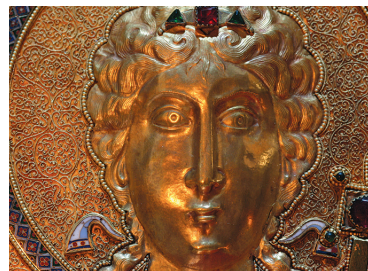
Bissera V. Pentcheva: Icon of the Arch- angel Michael, late tenth century (detail of the head illuminated by candle).