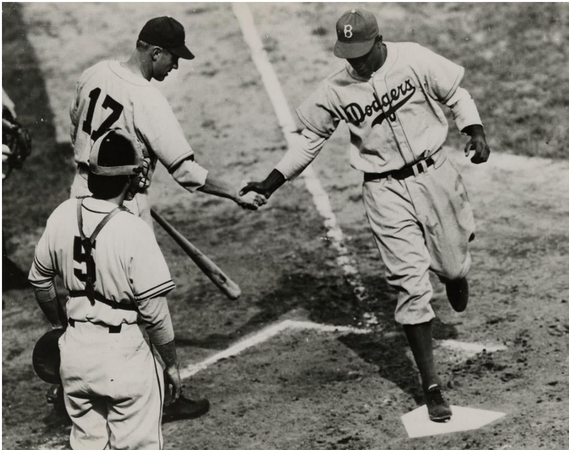
Jackie Robinson's first Major League home run, April 18, 1947. Vintage gelatin silver print.